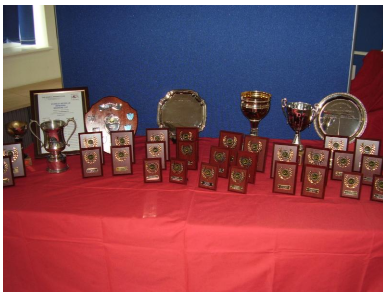
The Club's array of Trophies